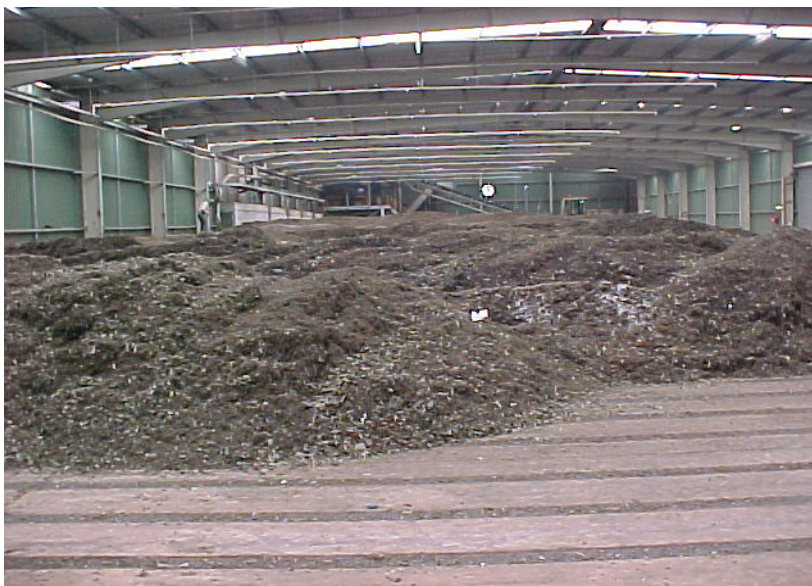
Plate 1. Photograph of an indoor aerated static pile composting facility. Composting is performed indoors, achieving protection from rain, pests and vermin. Air ducted through the piles is extracted from the building and directed to a biofilter which removes odours. An environmental management plan is required to maintain appropriate working conditions in the building, and to other minimise impacts through the release of leachate and odour.

Good facility design, alone, is not always adequate for minimising impacts on the environment. To