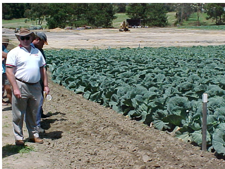
Plate 2. Photograph of cabbages on land treated with a composted soil conditioner.

Garden organics are defined by their component materials, including: putrescible garden organics (grass