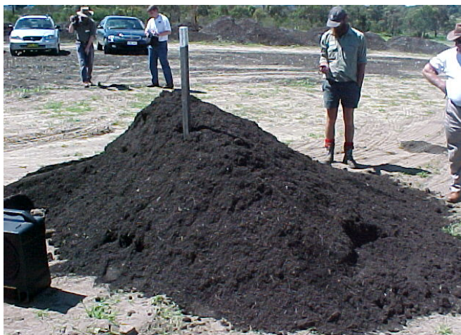
Plate 1. High quality soil conditioner to be incorporated into a poor quality, sandy soil used for growing vegetables such as cabbages in coastal New South Wales.

Where possible, Tables 1-9 specify the maximum permissible RO content within each product. This should assist consumers to identify products containing a higher recycled content, thereby reducing demand for non-recycled resources.