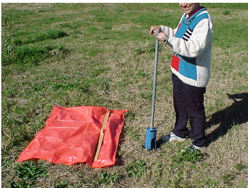
Figure 1: Soil sampling hand auger

This information sheet identifies the minimum soil testing requirements to guide soil and nutrient management when using RO products. This guide helps growers to implement a cost