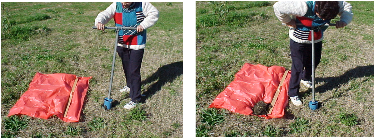
Figure 3. Soil sampling

However in the case of soil conditioners for deep rooted crops, if incorporation depth is deeper, topsoils should be sampled to the depth of incorporation.